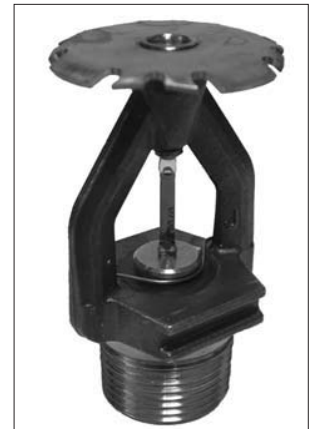
Model J112 Upright (RA 7326) - Bulb