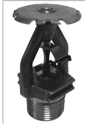
Model JL112 Upright (R 7326) - Link

SIN RA 7326 is Corrosion Resistant with White Polyester Coating.